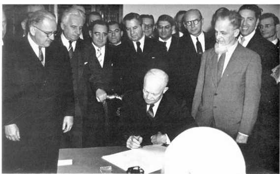
Eisenhower signs Universal Copyright Convention. November 1954 with Rex looking on